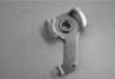
Brackets 1 per 50cm