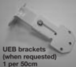
UEB brackets (when requested) 1 per 50cm